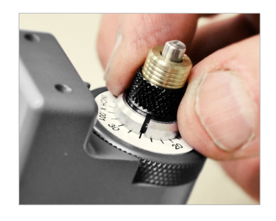
Blade depth is easily adjustable & set by turning the dial.