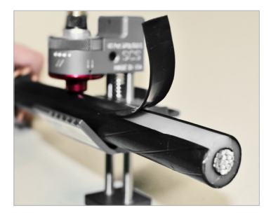
Simply pull the tool along the full cable length to perform longitudinal cuts.