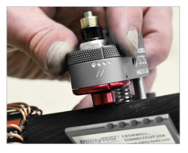
Four blade pitch settings adjust the spiral width for various cable sizes.