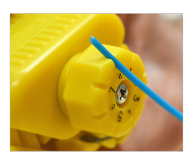
Built-in sizing channels determine proper setting for loose tube cables.