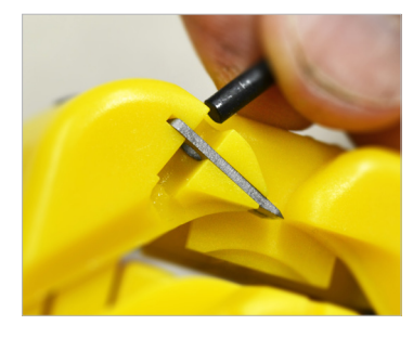
Fixed stainless steel blades require no adjustments and replace easily.

For more information or to locate the nearest authorized Ripley<sup>®</sup> distributor, please visit www.ripley-tools.com or call 1 (800) 528-8665 to speak to a customer service representative.